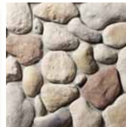
RIVER ROCK Copper Mountain S4370-8