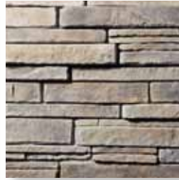
BLUFF STONE Easton S4835-5