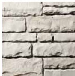
OHIO RUBBLE St. Charles S4780-5