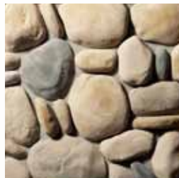
WASHED RIVER ROCK Barren S5305-6