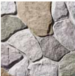
SPLITFACE Michigan S4290-1