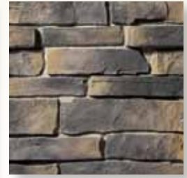
SOUTHEASTERN LEDGESTONE Sierra Madre S6150-4