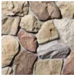
SPLITFACE Buckeye Blend S4260-8