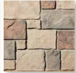
BAVARIAN CASTLE Nottingham S6270-10