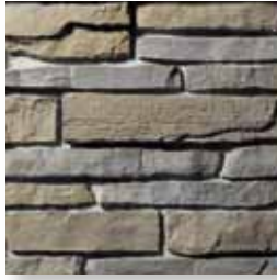
SOUTHEASTERN LEDGESTONE Cajun S6110-3