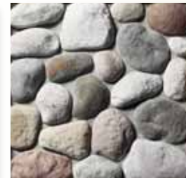
RIVER ROCK Comfort Blend S4330-8