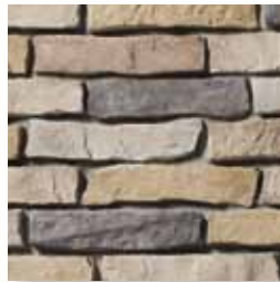
STONEBRICK Kirkland 2505-07