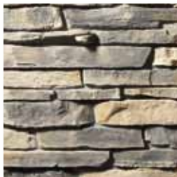
COUNTRY LEDGE West Chester S4095-7