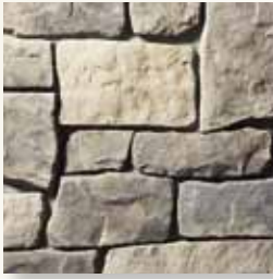
VENETIAN COBBLE Naples S5935-7