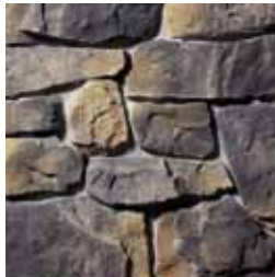
ITALIAN FIELDSTONE Toscana S5220-5