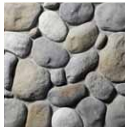
RIVER ROCK Natures Blend S4355-8