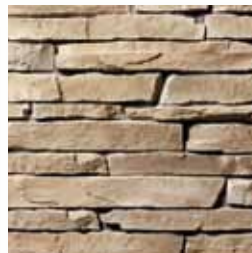
COUNTRY LEDGE Brown S4000-8