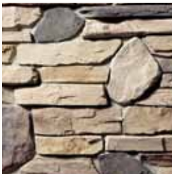
MOUNTAIN BLEND Medena S9050-7