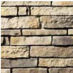
PRAIRIE BLUFF Newbury S5885-7