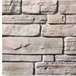
WEATHERED EDGE Pepin S5125-5