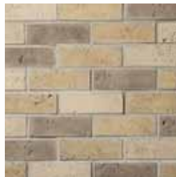
TRAVERTINE Quay 2206-07