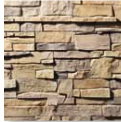
FAST STAK* Ancona S5005-7