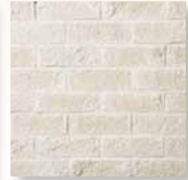
ESTATE Shelby 1204-07