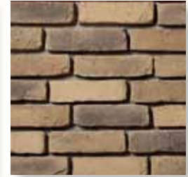
TUMBLED Kenyon 2302-07