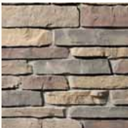
COUNTRY LEDGE Vancouver S4005-7