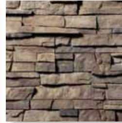
FAST STAK* Sable S5070-8