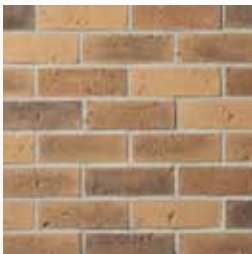
TRAVERTINE Pima 2205-07