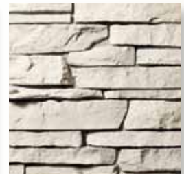
COUNTRY LEDGE Glacier Buff S4025-8