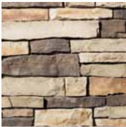
SOUTHEASTERN LEDGESTONE Tenor S6102-09