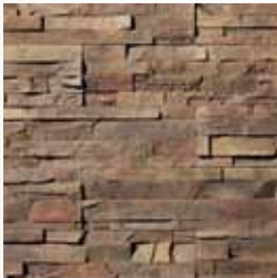
LONG ISLAND STAK* Aurora S6395-09