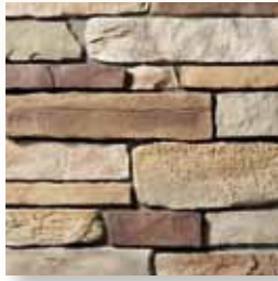
SOUTHEASTERN LEDGESTONE Butternut S6165-5