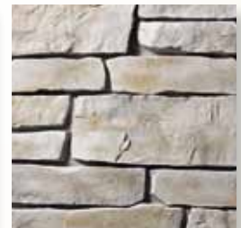
VENETIAN COBBLE Lamson S5925-5