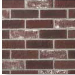
ESTATE Richton 1206-07