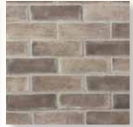
NEW BRICK Carbon Buff 2117-8