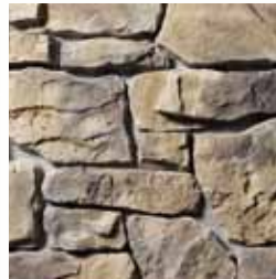
ITALIAN FIELDSTONE Bergamo S5215-5