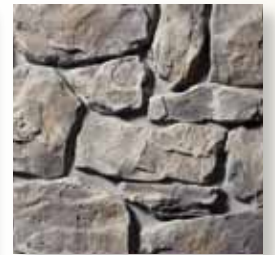
ITALIAN FIELDSTONE Tivoli S5200-5