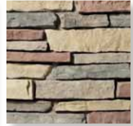
SOUTHEASTERN LEDGESTONE Saratoga S6145-4