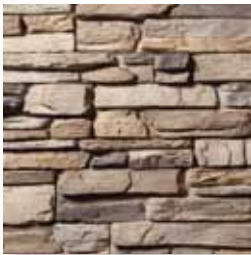
WESTERN LEDGE STAK* Appaloosa S4900-2