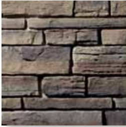
WEATHERED EDGE Kodiak S5120-0