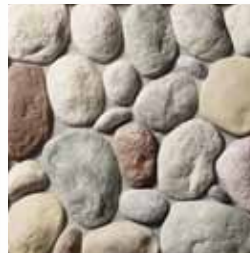
RIVER ROCK Manistee S4325-6