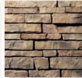
PRAIRIE BLUFF Camino S5855-5