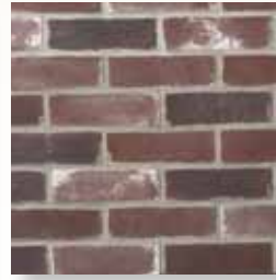
NEW BRICK Chicago Blend 2114-8