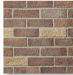
ESTATE Kershaw 1203-07