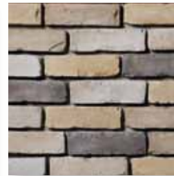
TUMBLED Tipton 2306-07