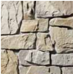
ITALIAN FIELDSTONE Venice S5205-5