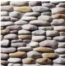
PEBBLESTONE River Bed S5400-8