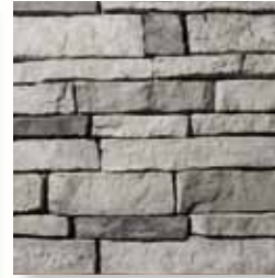
PRAIRIE BLUFF Mesquite S5895-10