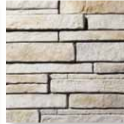
BLUFF STONE Outback S4800-8