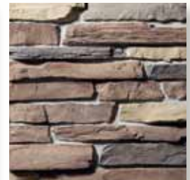
CLIFFSTONE Foxboro S5180-4