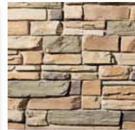
WESTERN LEDGE STAK* Burnt Hollow S4905-09