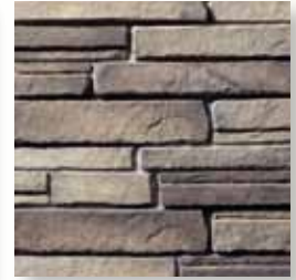
BLUFF STONE Seneca S4830-4