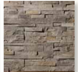
LONG ISLAND STAK* Alden S6385-09