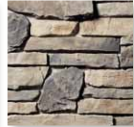
MOUNTAIN BLEND Barton S9040-7