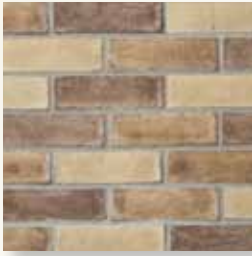
NEW BRICK Sienna Blend 2103-8