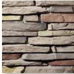
MONTANA LEDGE Ronan S4675-6