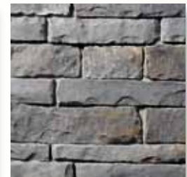
OHIO RUBBLE Smokey Hollow S4725-8