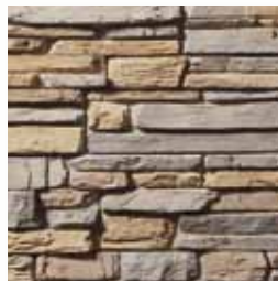
WESTERN LEDGE STAK* Morgan S4935-7

* Groutless pattern * Patrón sin incruste.