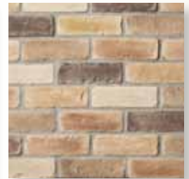
USED BRICK Chicago Used 1100-8