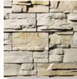
FAST STAK* Nema S5060-8