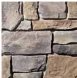
VENETIAN COBBLE Milan S5910-5