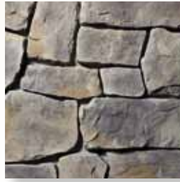
VENETIAN COBBLE Salerno S5915-5