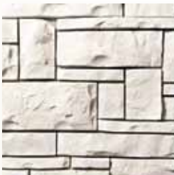
SANGRIA Spanish Wheat S4210-8*