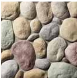
RIVER ROCK Northern Blend S4345-8