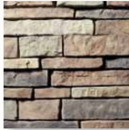
PRAIRIE BLUFF Varena S5875-6