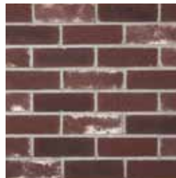
TRAVERTINE Elmwood 2207-07