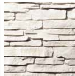
COUNTRY LEDGE Fossil Beige S4060-8