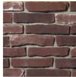
STONEBRICK Tinley 2507-07