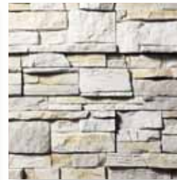
FAST STAK* Mirage Gray S5010-9