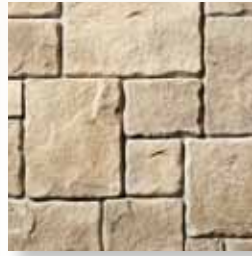
BAVARIAN CASTLE Westwood S6230-4