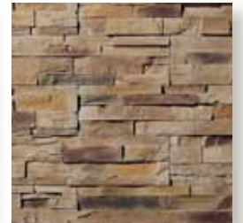
LONG ISLAND STAK* Woodridge S6390-09

* Groutless pattern * Patrón sin incruste.