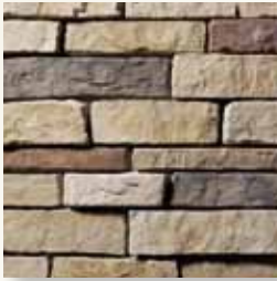
PRAIRIE BLUFF Navajo S5800-9