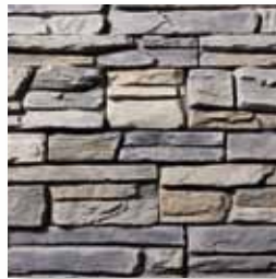
WESTERN LEDGE STAK* Lasino S4925-5