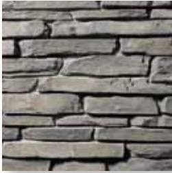
MONTANA LEDGE Cactus Ridge S4620-8