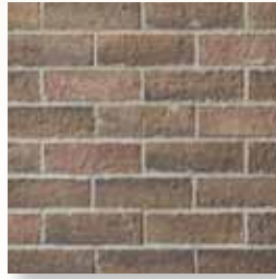
ESTATE Clinton 1201-07