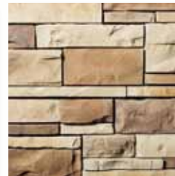
SANGRIA Saddle S4201-09