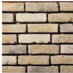
TUMBLED Maverick 2304-07