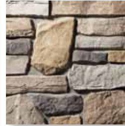
MOUNTAIN BLEND Athena S9035-7