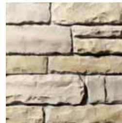
OHIO RUBBLE Prairie Mountain S4720-8