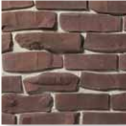
CLINKER BRICK Red 2600-8