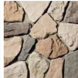
ITALIAN FIELDSTONE Torino S5230-10