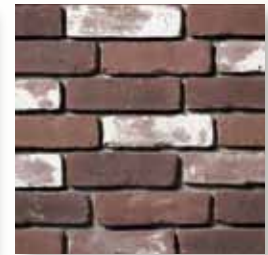
TUMBLED Harwood 2307-07