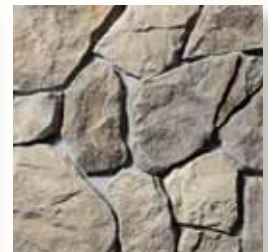
EASTERN FIELDSTONE Walden S6025-5