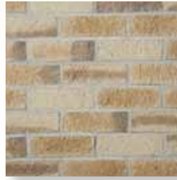
ESTATE Navarro 1202-07