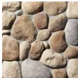
RIVER ROCK Desert Rust S4350-8