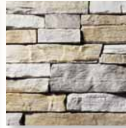
WEATHERED EDGE Fon-Du-Lac S5100-8