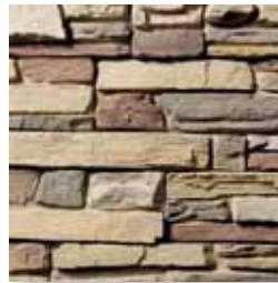
WESTERN LEDGE STAK* Mustang S4920-3