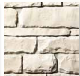
OHIO RUBBLE Oklahoma Crème S4750-9

Please note, Sangria - Spanish Wheat: S4210-8 is shown with some pieces installed vertically. Por favor note, Sangria - Spanish Wheat: S4210-8 se muestra con algunas piezas instaladas verticalmente.