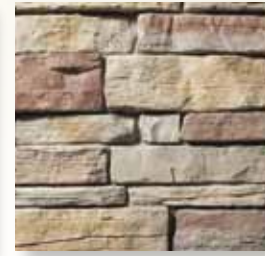
WEATHERED EDGE Sun Prairie S5110-8