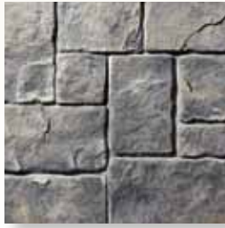
BAVARIAN CASTLE Norwich S6250-5