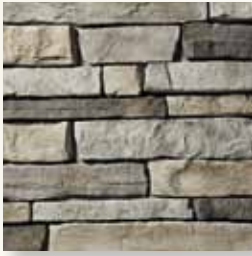
SOUTHEASTERN LEDGESTONE Quincy S6115-7