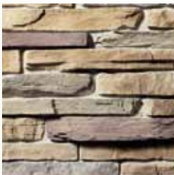
CLIFFSTONE Durango S5160-0