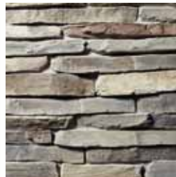
CLIFFSTONE Montour S5185-4