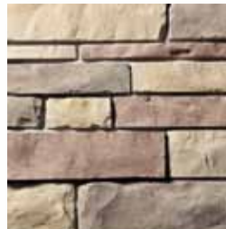
SANGRIA Tolono S4240-4