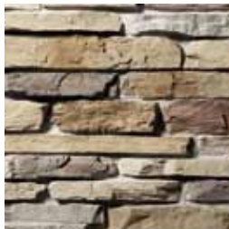
CLIFFSTONE Apache S5170-0