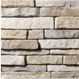
PRAIRIE BLUFF Laner S5820-0