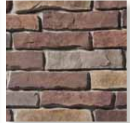
STONEBRICK Ferrara 2503-07