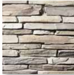
MONTANA LEDGE Suede Gray S4630-8