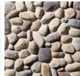
NUGGETS Superior S5600-9