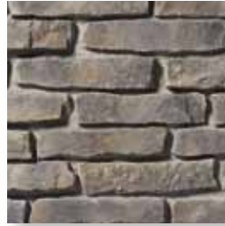
STONEBRICK Beringer 2501-07