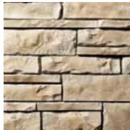
SANGRIA Castano S4200-8