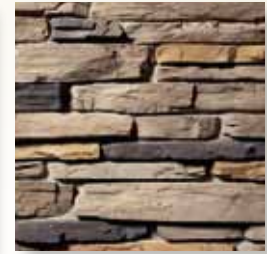
MONTANA LEDGE Chesapeake S4670-4