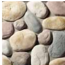
WASHED RIVER ROCK Erie S5310-6