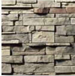
FAST STAK* Velarde S5025-7