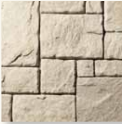
BAVARIAN CASTLE Antique Buff S6240-4