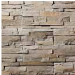
LONG ISLAND STAK* Hempstead S6365-10