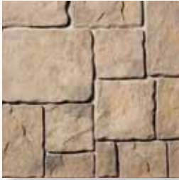
BAVARIAN CASTLE Oxford Brown S6210-3