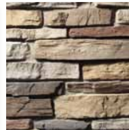
CLIFFSTONE Bradford S5190-7