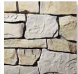
VENETIAN COBBLE Napoli S5900-5