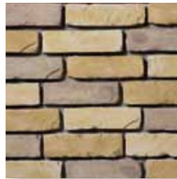
TUMBLED Richmond 2305-07