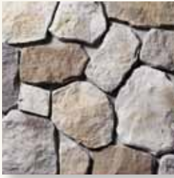
EASTERN FIELDSTONE Hampton S6020-5