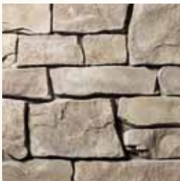
VENETIAN COBBLE Biella S5905-5