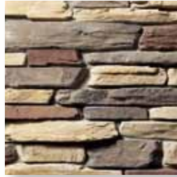
MONTANA LEDGE Cameron S4680-6