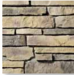
SOUTHEASTERN LEDGESTONE Wilmington S6175-5