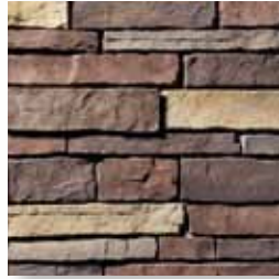
PRAIRIE BLUFF Red Mountain S5865-5