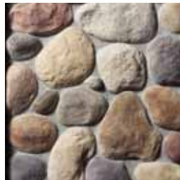
RIVER ROCK Minnesota Blend S4385-8