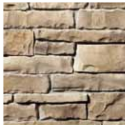
OHIO RUBBLE Olin Valley S4710-8