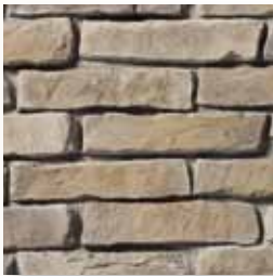
STONEBRICK Kendall 2504-07