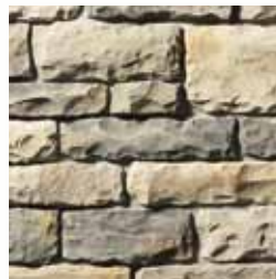
OHIO RUBBLE St. Claire S4705-7