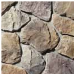
EASTERN FIELDSTONE Englewood S6000-5