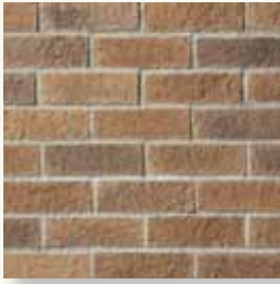
ESTATE Caldwell 1200-07