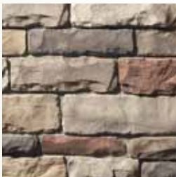
OHIO RUBBLE Monroe S4715-7