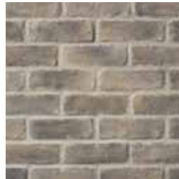
USED BRICK Talbot 1114-07