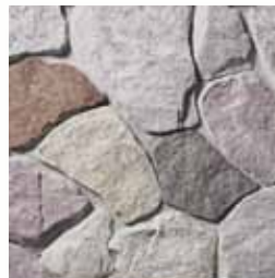
SPLITFACE Great Lakes S4250-8