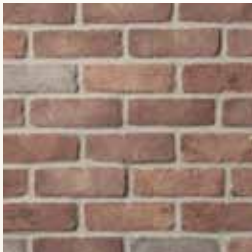
USED BRICK Essex 1112-07