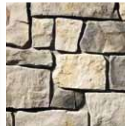
VENETIAN COBBLE Florence S5940-7