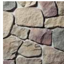
EASTERN FIELDSTONE Stonehill S6015-5