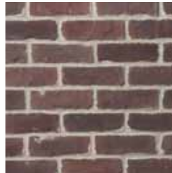
USED BRICK Old World 1106-8