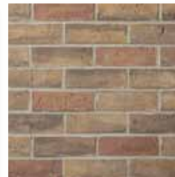
TRAVERTINE Mesa 2203-07