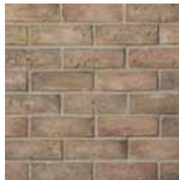
TRAVERTINE Duval 2201-07