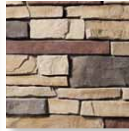
SOUTHEASTERN LEDGESTONE Tupelo S6100-3