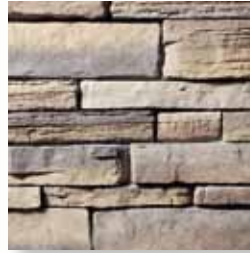
WEATHERED EDGE Kenosha S5130-5