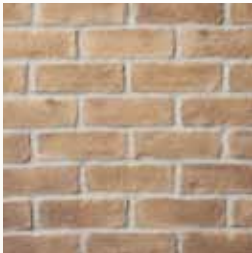
USED BRICK Lexington 1103-8