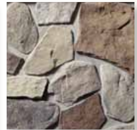
SPLITFACE Willows S4285-0