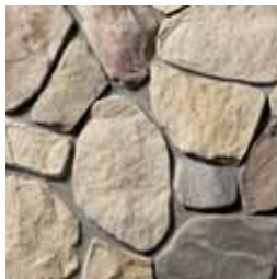
SPLITFACE Sagebrush S4270-9