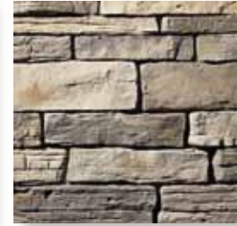
WEATHERED EDGE Bristol S5140-7