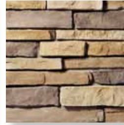
SOUTHEASTERN LEDGESTONE Allegheny S6170-5