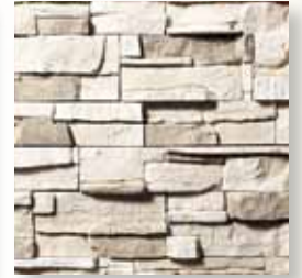
FAST STAK* Jaffa Beige S5040-9