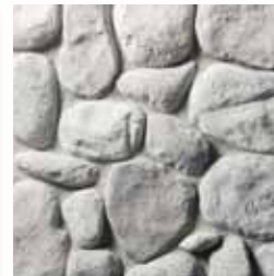
RIVER ROCK Mission S4315-08