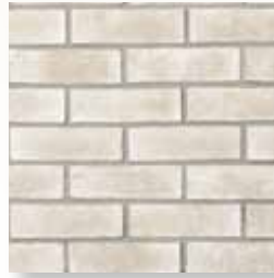
NEW BRICK Dover 2112-8