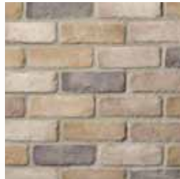
USED BRICK Madison 1113-07