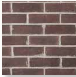
NEW BRICK Red Colonial 2110-8