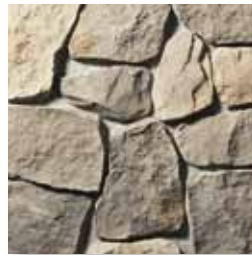
SPLITFACE Mansfield S4255-7