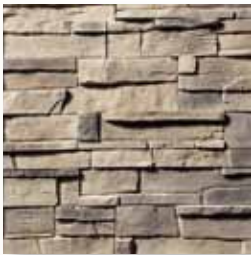
FAST STAK* Russet Brown S5090-6