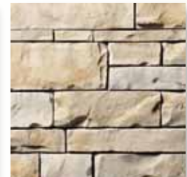
SANGRIA Pueblo S4245-5