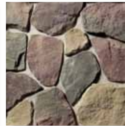
SPLITFACE Painted Desert S4280-0