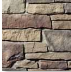
MOUNTAIN BLEND Comforts of Home S9030-6