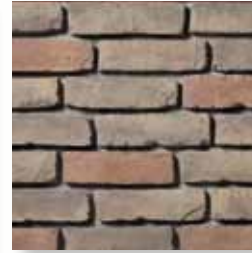
TUMBLED Franklin 2301-07