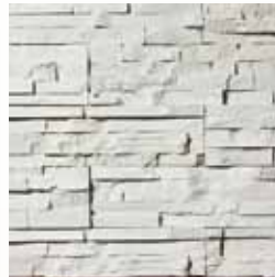
LONG ISLAND STAK* Manhattan S6380-09