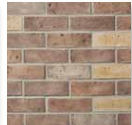
TRAVERTINE Otero 2204-07