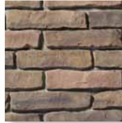
STONEBRICK Columbia 2502-07