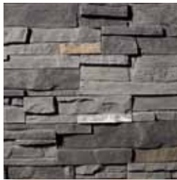
FAST STAK* Black Onyx S5035-09