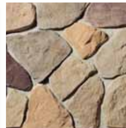
SPLITFACE Westin Willows S4275-08