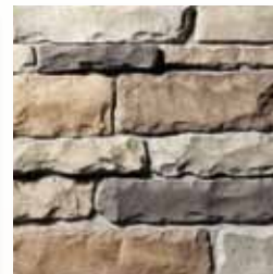
OHIO RUBBLE Hudson Bay S4760-0