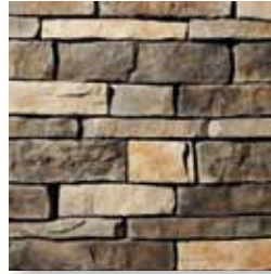
PRAIRIE BLUFF Prescott S5890-10