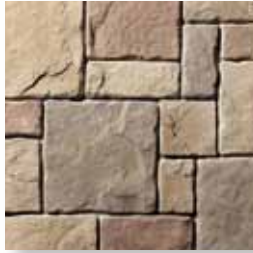
BAVARIAN CASTLE Liverpool S6260-6