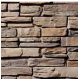
WESTERN LEDGE STAK* Moroccan S4910-3