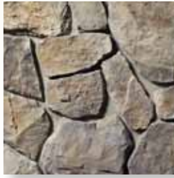
EASTERN FIELDSTONE Tishbury S6010-5