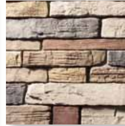
WEATHERED EDGE Trenton S5135-7