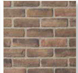
USED BRICK Cortland 1111-07