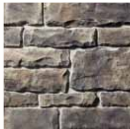
OHIO RUBBLE Stonehenge S4775-4