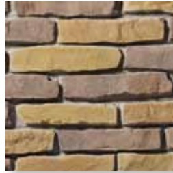
STONEBRICK Alexander 2500-07