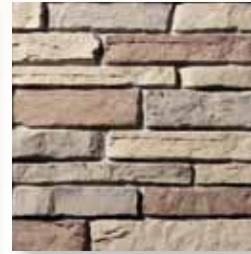
PRAIRIE BLUFF Oakwood S5830-4