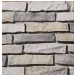
STONEBRICK Linden 2506-07