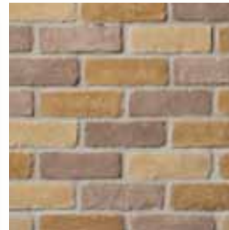
USED BRICK Ash 1110-07