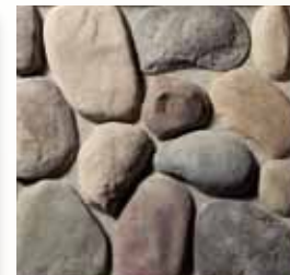
WASHED RIVER ROCK Yakima S5325-6