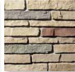
PRAIRIE BLUFF Yuma S5810-0