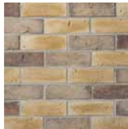
TRAVERTINE Luna 2202-07