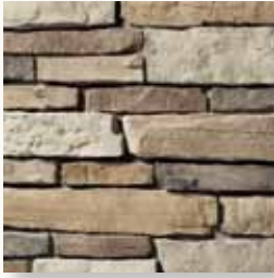
SOUTHEASTERN LEDGESTONE Barrington S6155-4