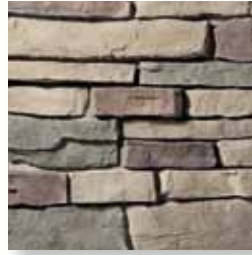
SOUTHEASTERN LEDGESTONE Crimson Mountain S6185-6