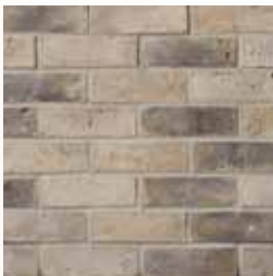
TRAVERTINE Crane 2200-07