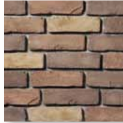
TUMBLED Burke 2300-07