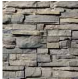
FAST STAK* Cheyenne Ridge S5050-8