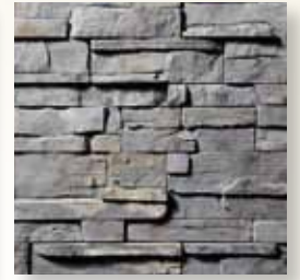
FAST STAK* Gunflint Gray S5020-9