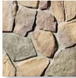
EASTERN FIELDSTONE Burnt Hollow S6005-09