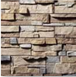
FAST STAK* Cashmere S5015-7