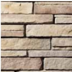
BLUFF STONE Sunset S4820-8