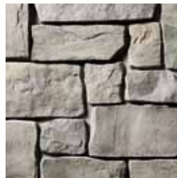
VENETIAN COBBLE Molise S5930-6