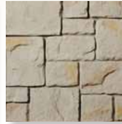
BAVARIAN CASTLE Preston S6265-10