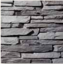
MONTANA LEDGE Rocky Mountain S4610-8