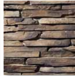
MONTANA LEDGE Leather Brown S4650-8