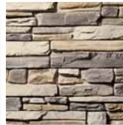
WESTERN LEDGE STAK* Belgian S4930-5