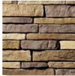
PRAIRIE BLUFF Mojave S5860-5