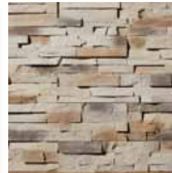
LONG ISLAND STAK* Niagara S6375-09