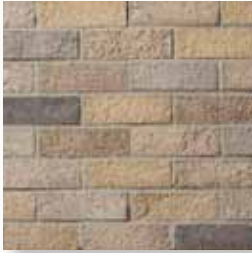
ESTATE Sumter 1205-07