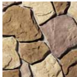
EASTERN FIELDSTONE Hanover S6030-7