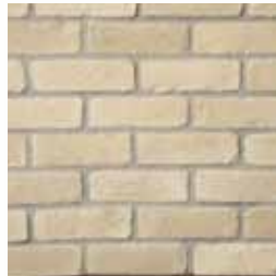
USED BRICK Buff 1104-8