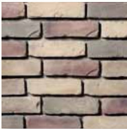
TUMBLED Lincoln 2303-07