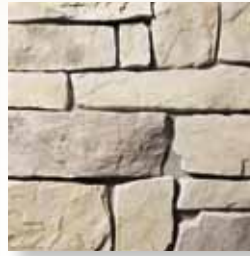
VENETIAN COBBLE Genoa S5920-5